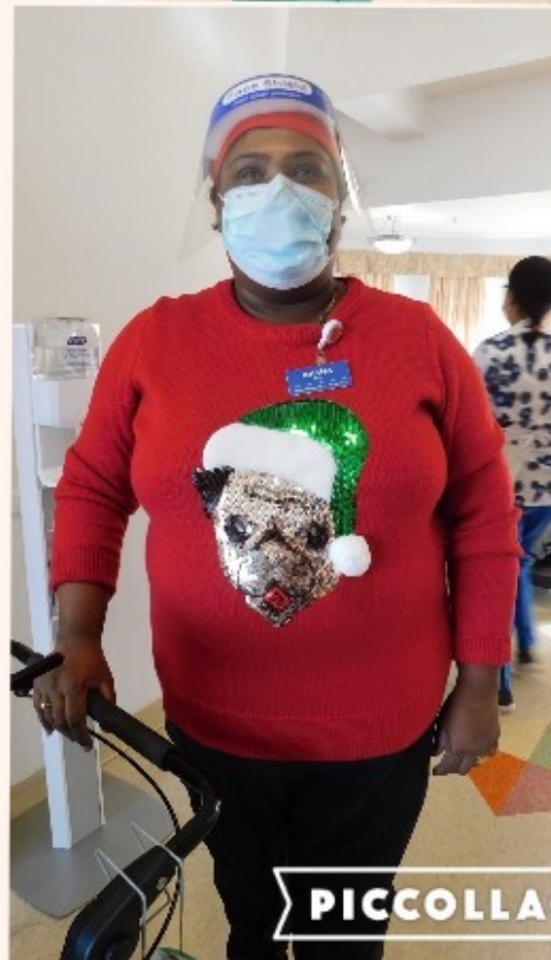
Ugly sweater contest at Craiglee .....