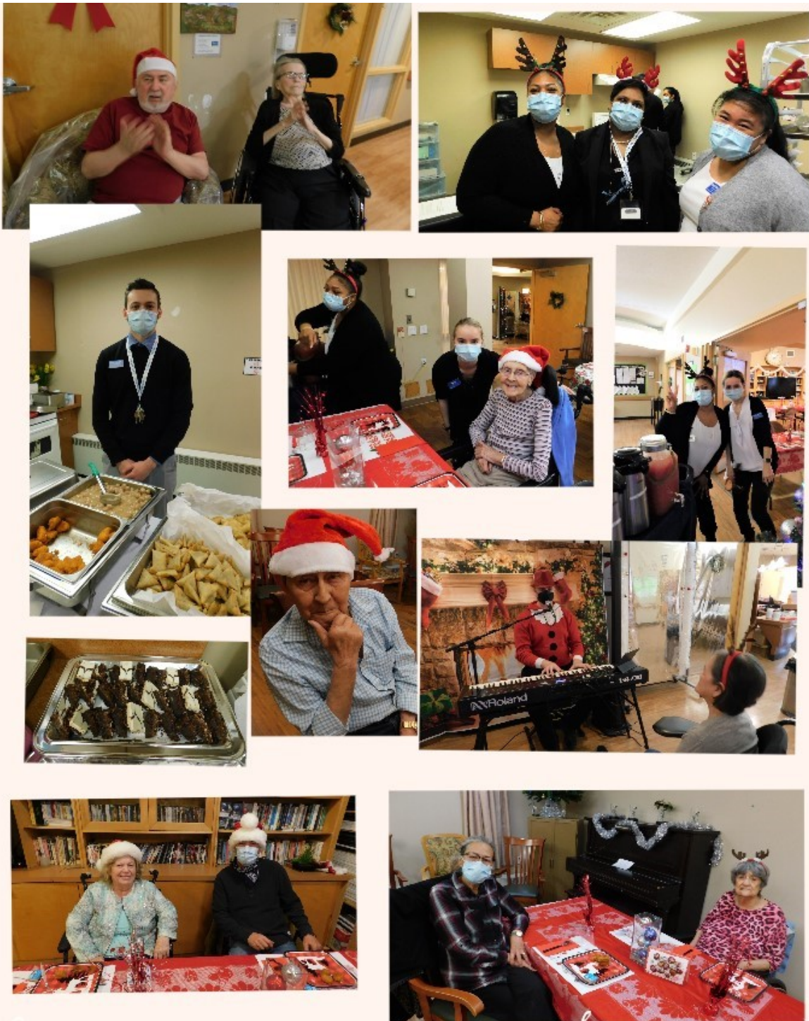
Christ Christmas Party 1st Flo PICCOLLAGE

Our first Christmas party with the first-floor resident and families. Such a great afternoon! Live music, good food and first-class service from the management team. A day to remember!